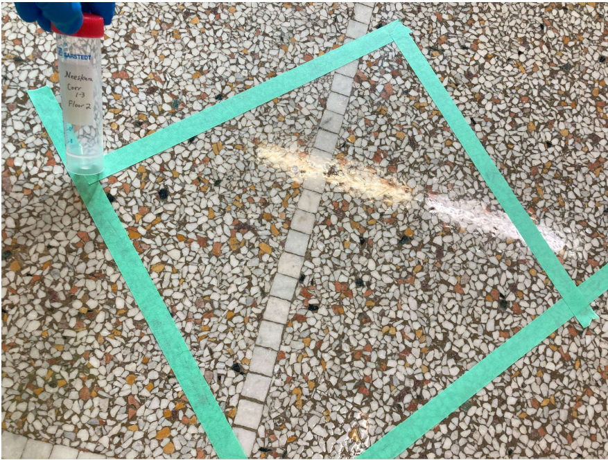
Figure 1: Example of a floor sample within one of the corridors.