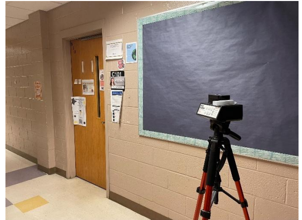
Hallway at C101