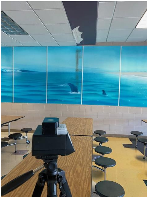
Cafeteria Air Sample