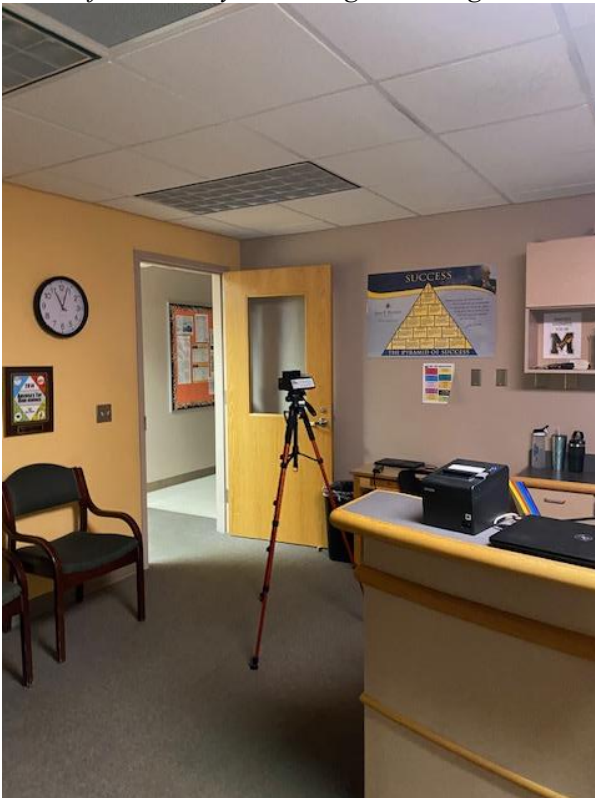
A101 Admin Reception