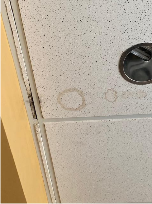
Cafeteria entry – staining on ceiling tiles