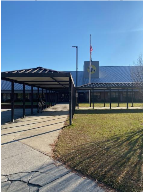
Manteo High School – Front Exterior