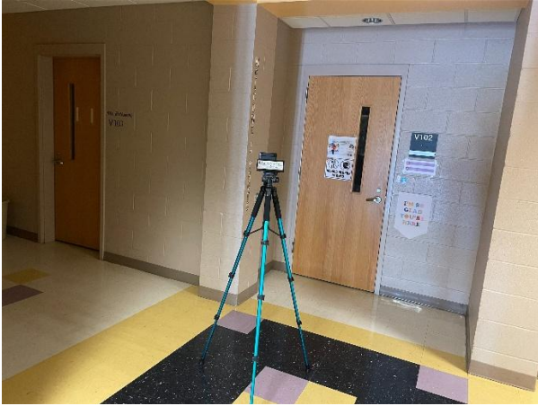
Hallway at V102