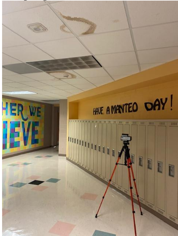
Hall at A200