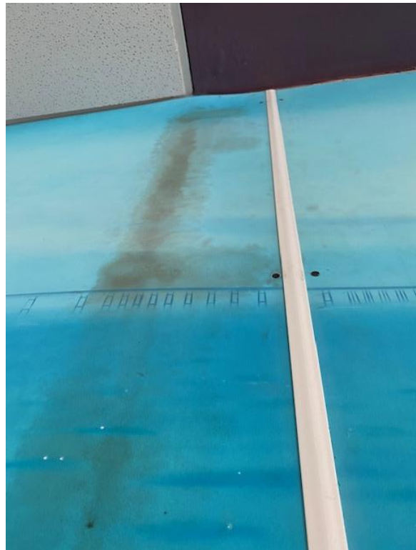
Cafeteria - staining on wall