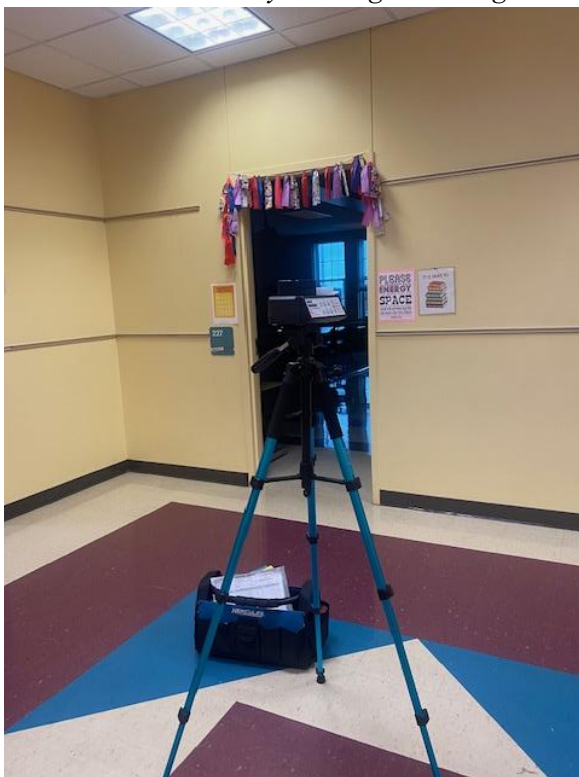
Hallway at 227