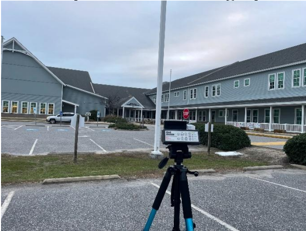
Nags Head Elementary – Front exterior