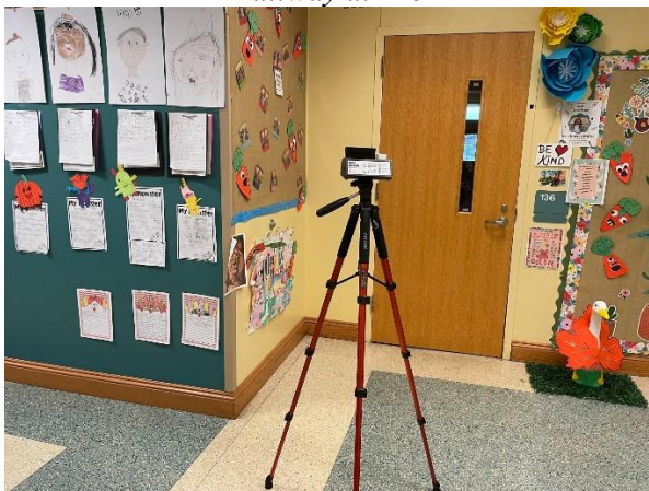
Hallway at 136