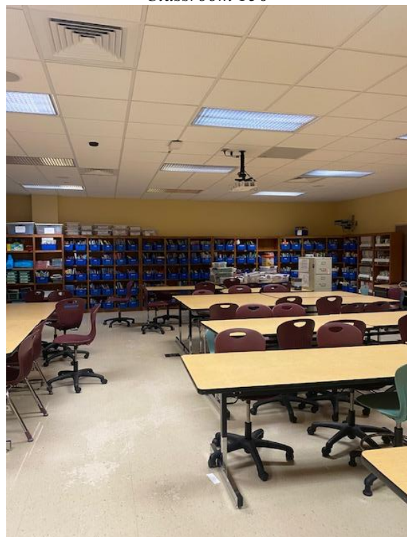
Classroom 214 Computer Lab