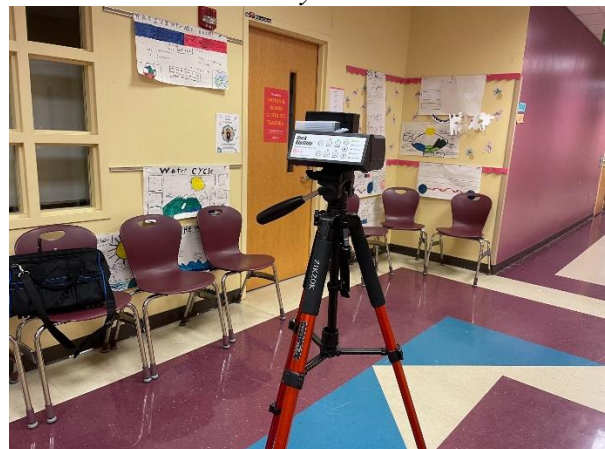
Hallway at 237