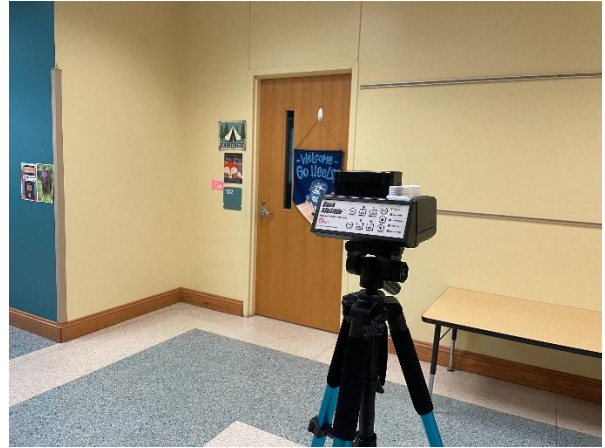
Hallway at 132