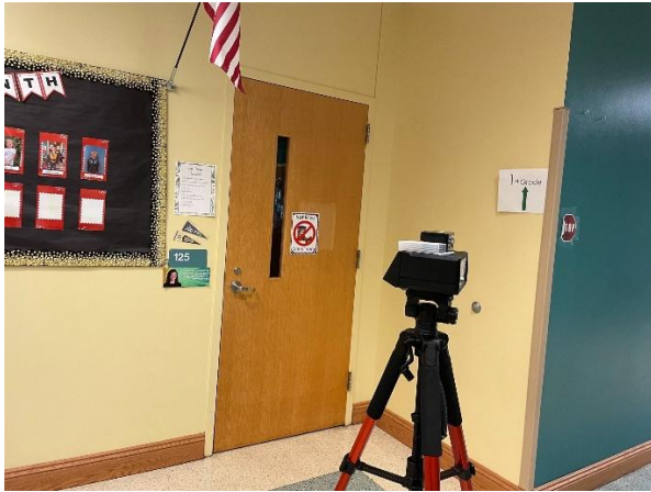
Hallway at 125