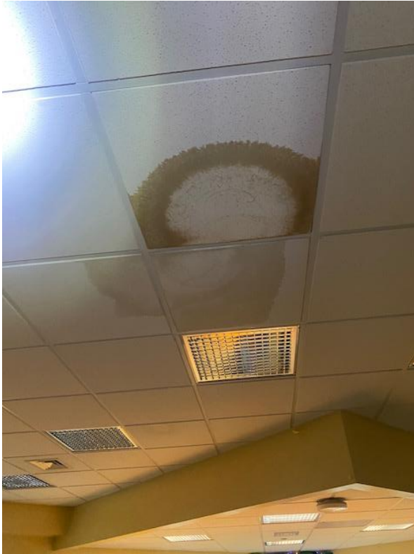
Media Center – heavy staining on ceiling tiles