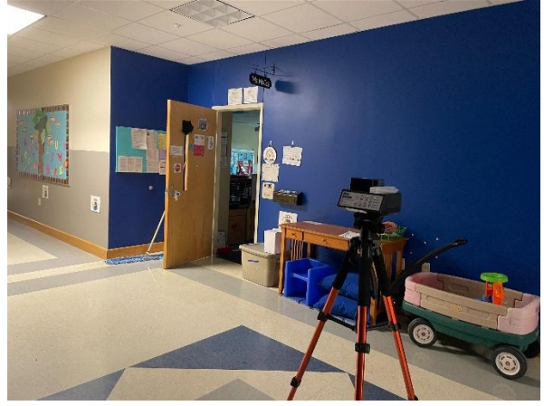
Hallway at A109