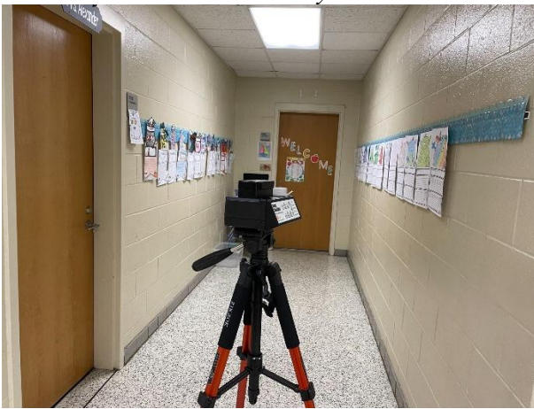
Hall at D128