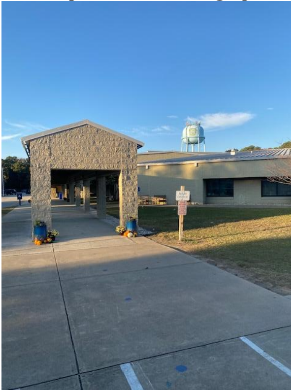
Kitty Hawk Elementary – Front exterior