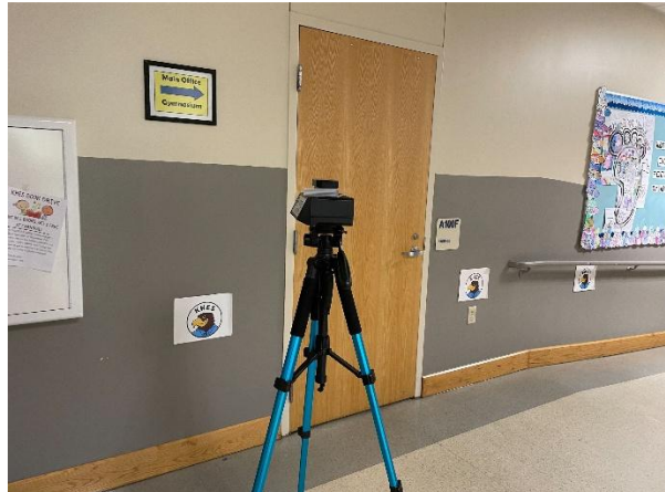
Hallway at A100F