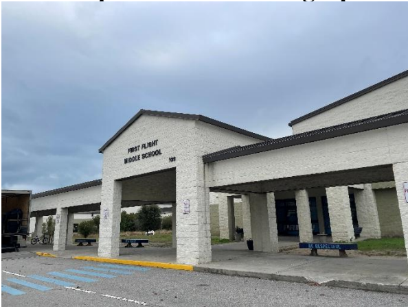
First Flight Middle School – Front exterior