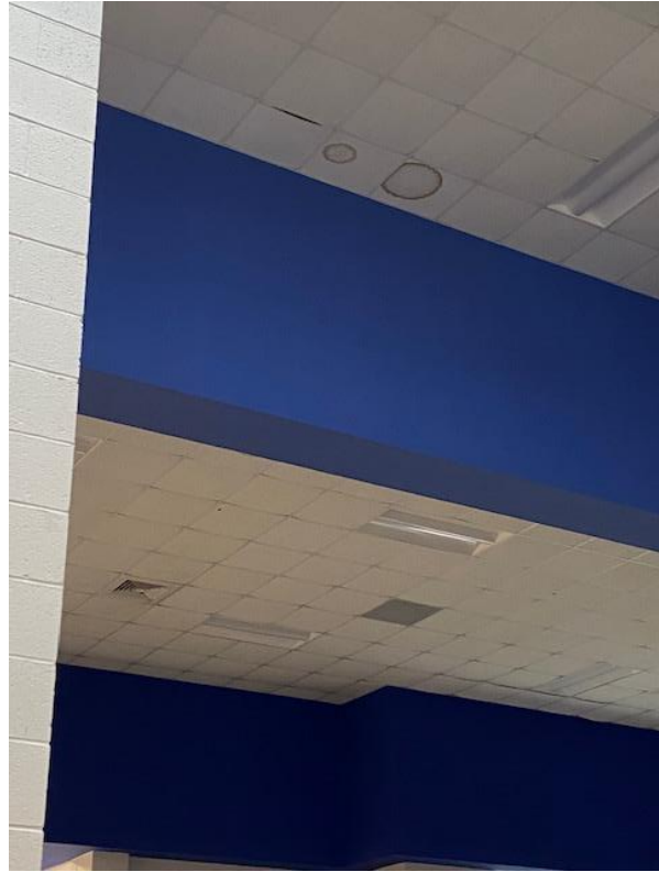
Cafeteria – stained ceiling tiles