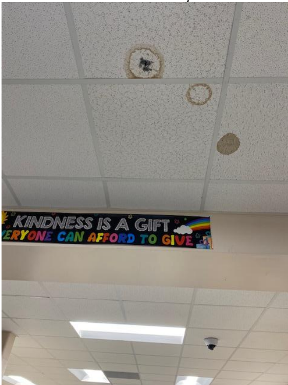
Hall at A105 – stained ceiling tiles with fungal growth