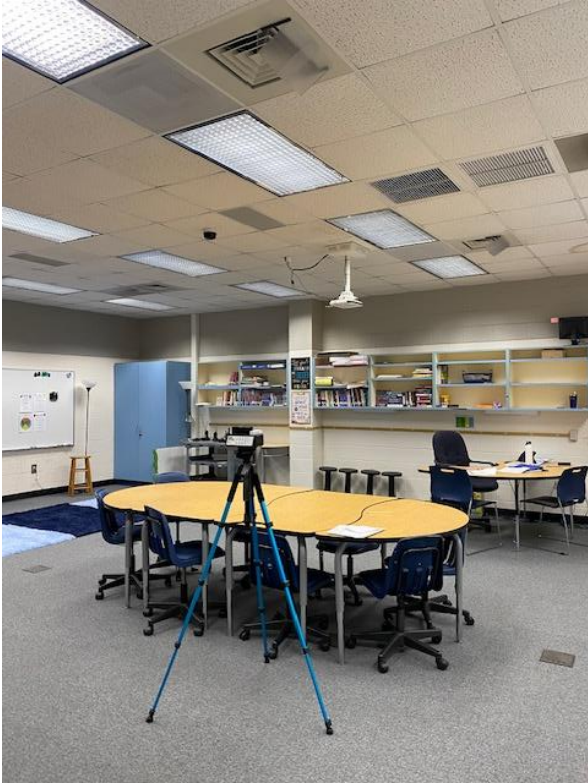
Classroom L148 – Computer Lab