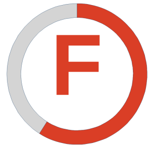
Closing the Gaps