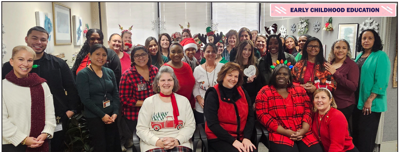
EARLY CHILDHOOD EDUCATION