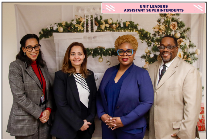
UNIT LEADERS ASSISTANT SUPERINTENDENTS