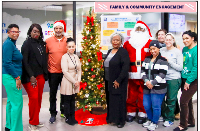
FAMILY & COMMUNITY ENGAGEMENT