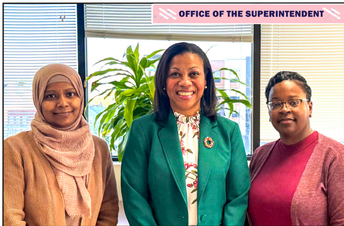
OFFICE OF THE SUPERINTENDENT