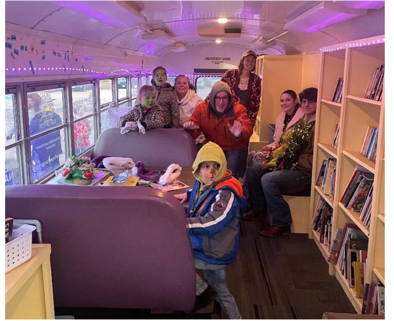
We had a great time on the Purple Bus at the parade!