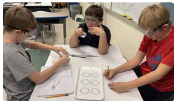
HOW CAN WE IDENTIFY MATERIALS BASED ON THEIR PROPERTIES...