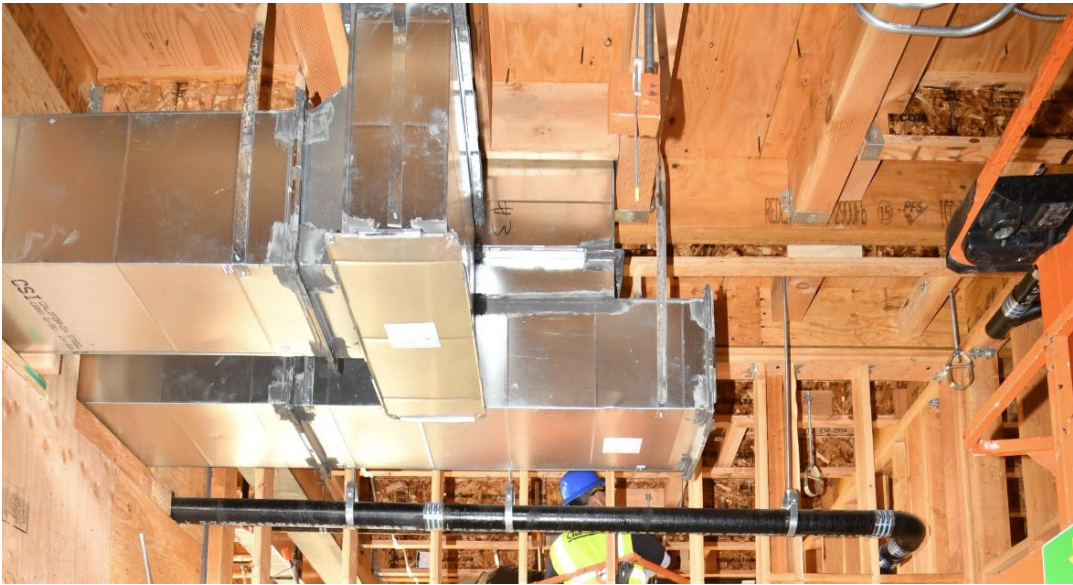
Making it all fit.