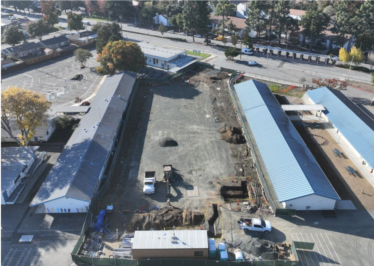
Aerial view above the playground looking toward the old multipurpose building on November 26, 2025.