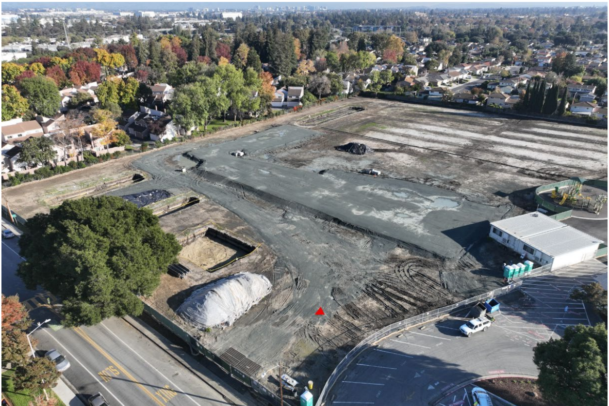
Aerial view over Chromite Drive looking southeast on November 26, 2025. The parking lot and stormwater retention basins are on the left. The new building pads are in the middle, and the new turf field is in the rear.