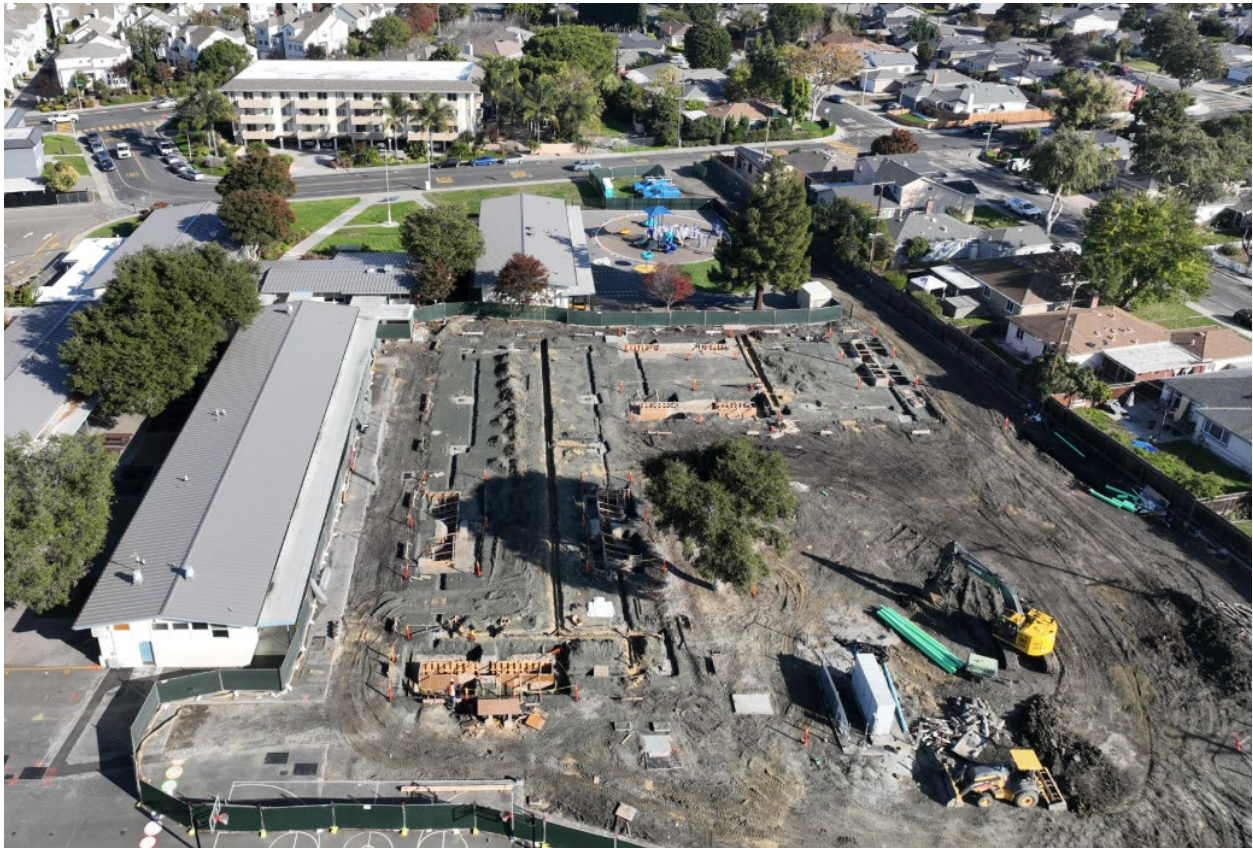
Aerial View looking east on November 26, 2025.