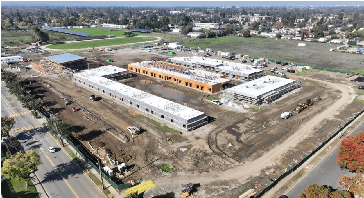
View above Teal Drive on November 26, 2025. The office is on the right, classroom wings in the middle, and the multipurpose building on the left.