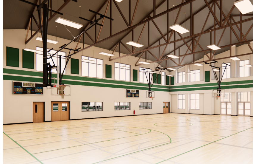
Preliminary Rendering of Urban Middle School Remodeled Gym

Farnsworth Middle School presents a different set of challenges. Although the project is primarily new construction, the team must carefully fit the new building footprint and associated infrastructure onto the site while keeping the existing school fully operational throughout construction.