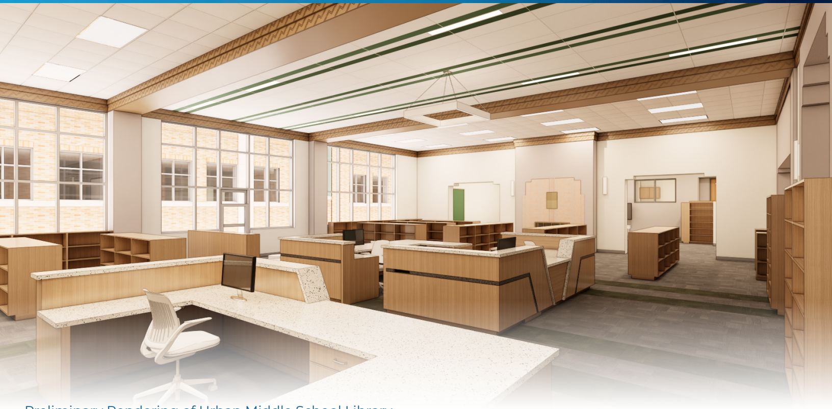
Preliminary Rendering of Urban Middle School Library