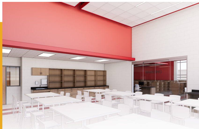
Preliminary Rendering of Farnsworth Middle School Marker Space