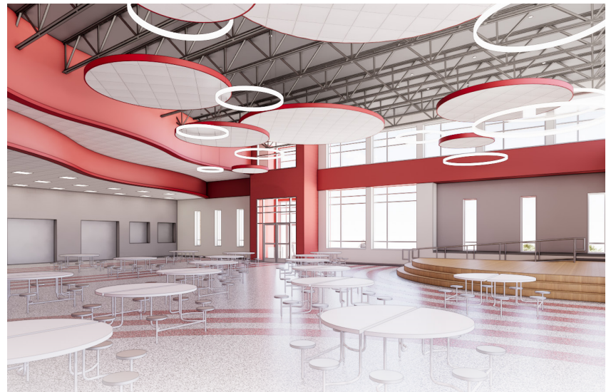
Preliminary Rendering of Farnsworth Middle School Cafeteria