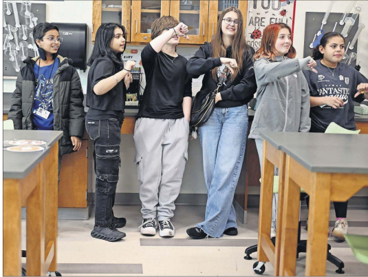
Students react to a hypothetical debate question during a meeting of the Groton Middle School Debate Club on Monday.