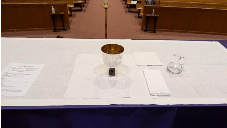
Altar set up should look like this.