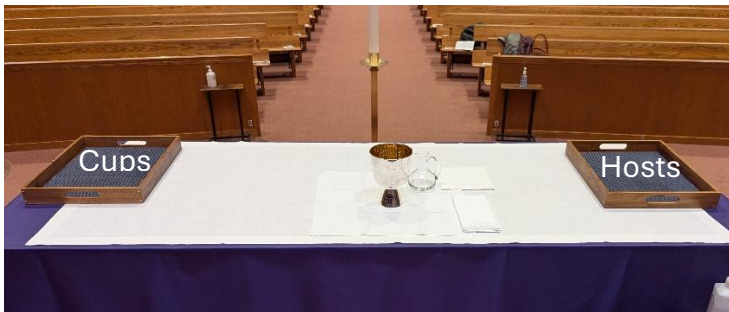
Altar set up with trays.

Corporal—to dress—placed folded on the altar, with raw edge on right and folded edge on left...open first/top flap (1) right to left; (2) open next flap left to right; (3) open next flap up and (2) last flap down. (Sacristan is placing corporal at start of Mass).