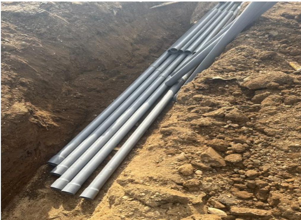
Hempstead ABGS MS – Underground Electrical feeds