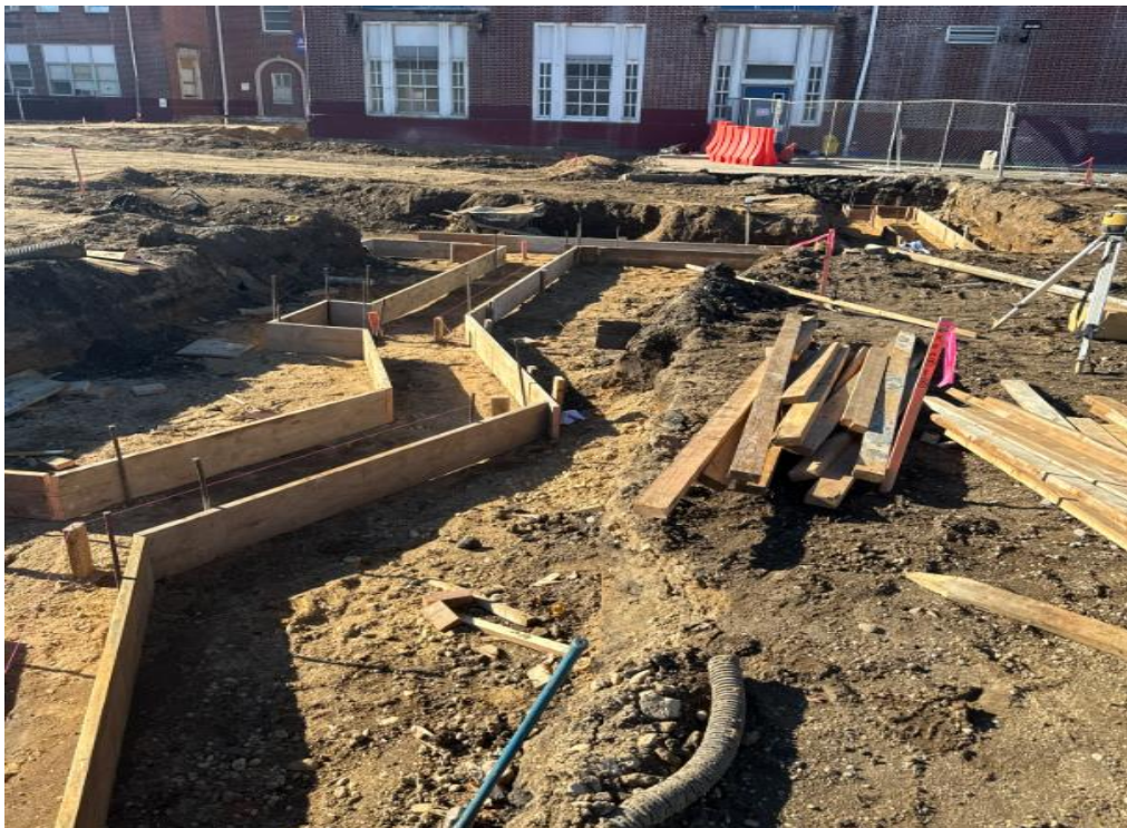
Hempstead ABGS MS – Footings