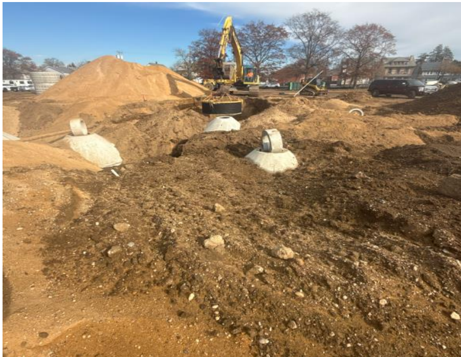
Hempstead ABGS MS – Drainage Pools