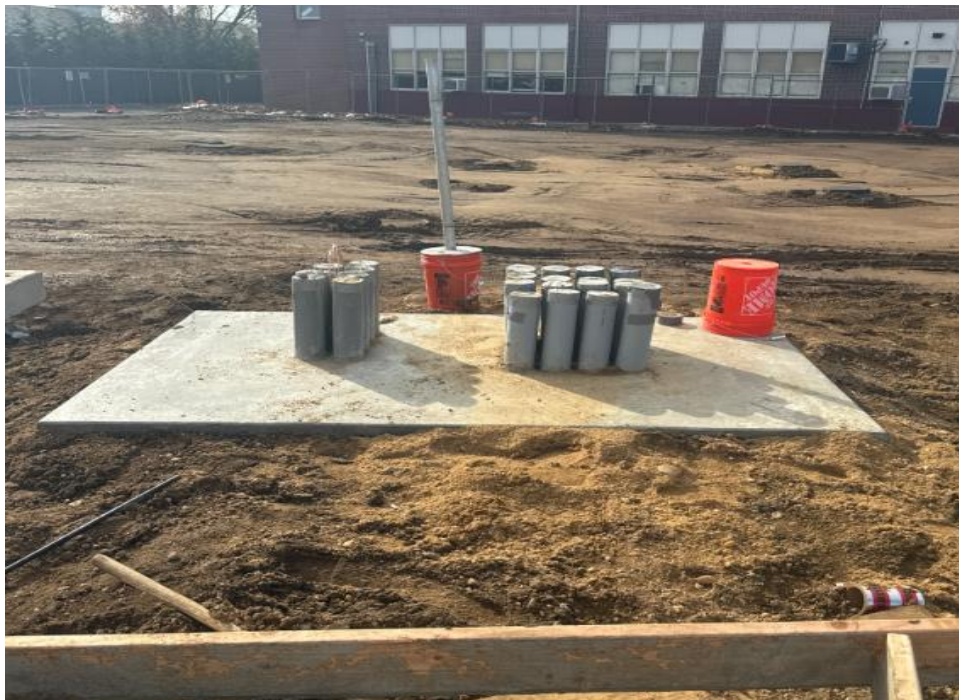
Hempstead ABGS MS – Transformer Island