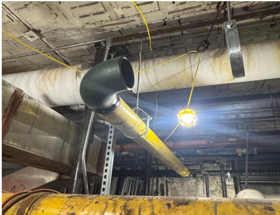
Hempstead ABGS MS – New Gas Feed