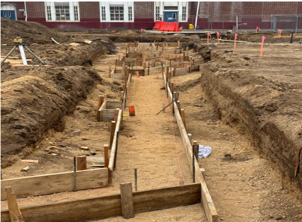
Hempstead ABGS MS – Footings