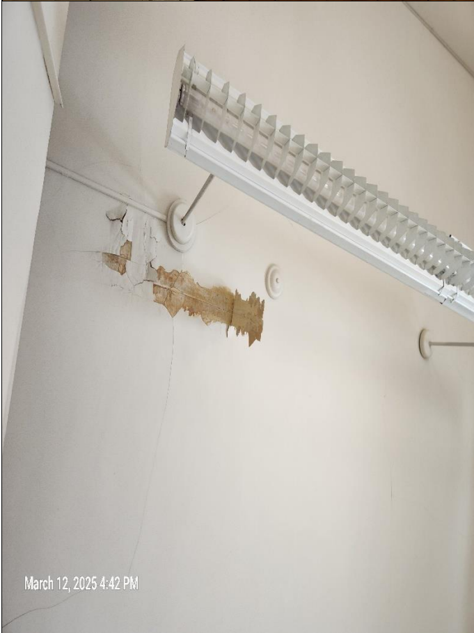
March 12, 2025 4:42 PM