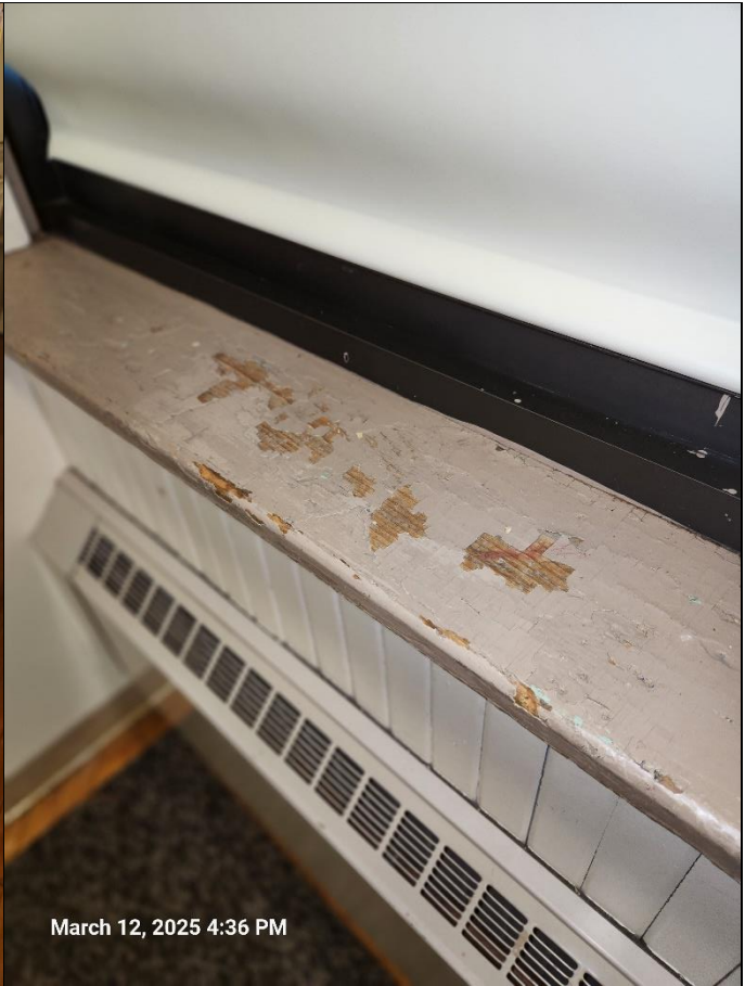
March 12, 2025 4:36 PM