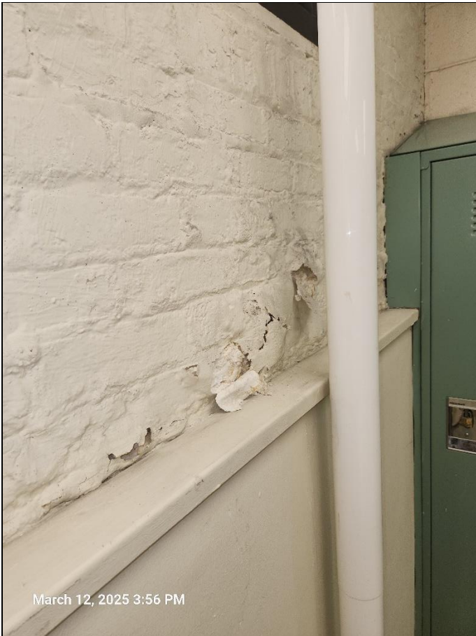
March 12, 2025 3:56 PM