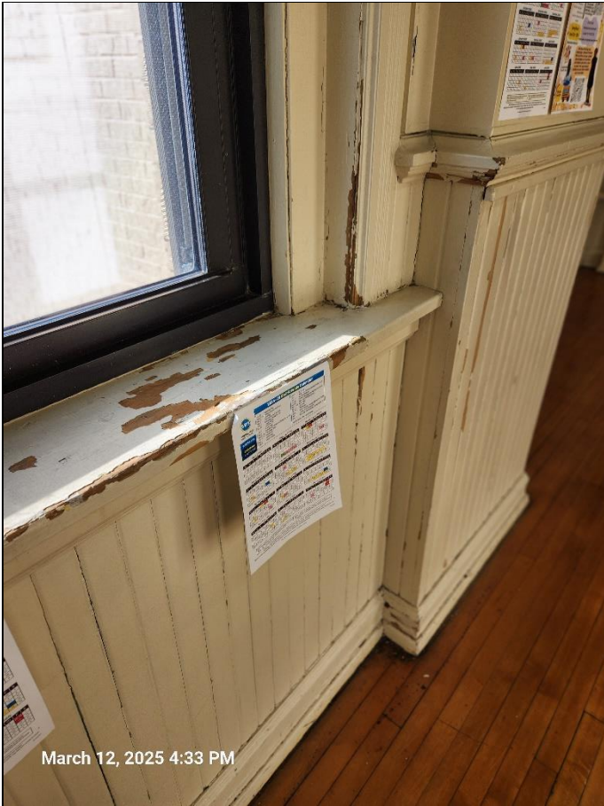
March 12, 2025 4:33 PM