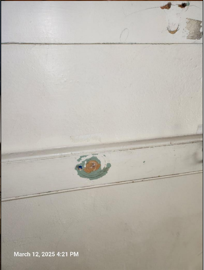
March 12, 2025 4:21 PM