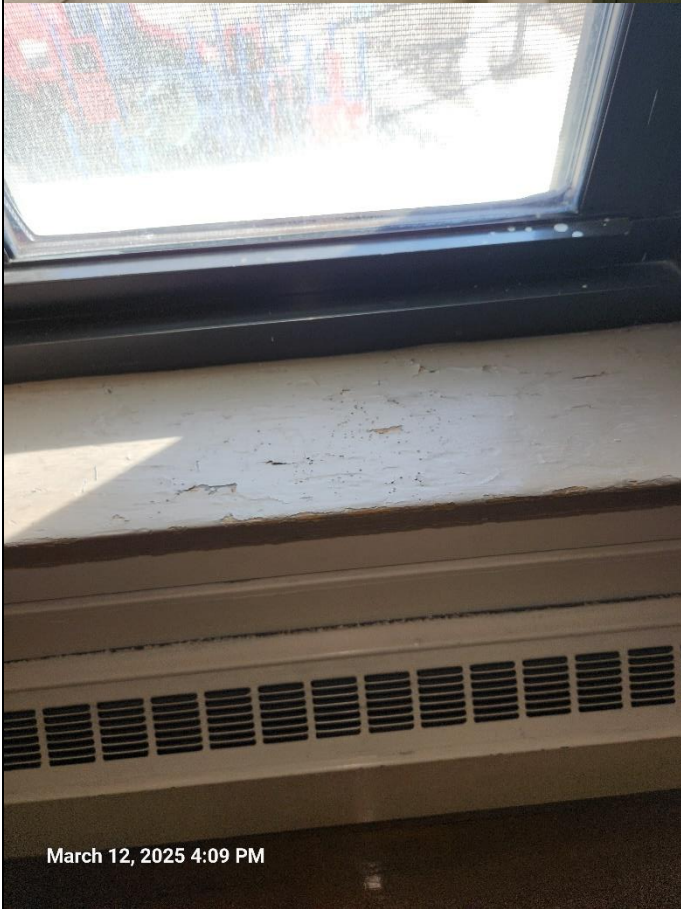
March 12, 2025 4:09 PM