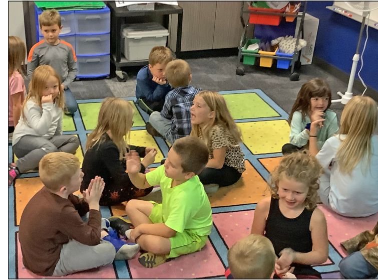
FIRST GRADERS PAIR UP for some fun learning games on their new classroom rug. See "Elementary grants" article on page 1.