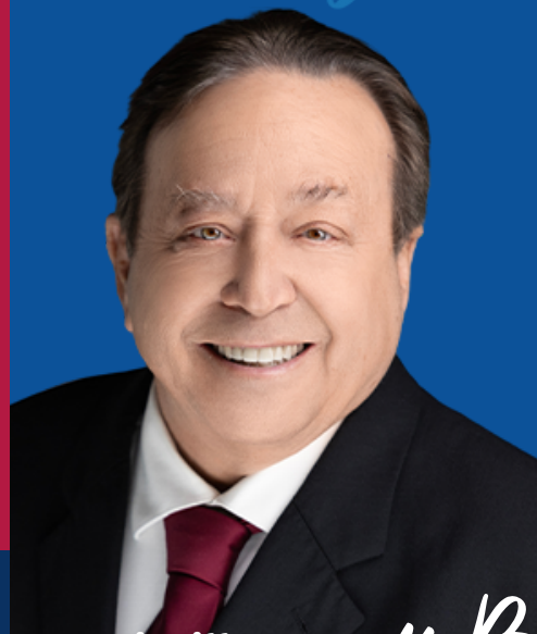
Mayor Joe Pizzillo, City of Goodyear