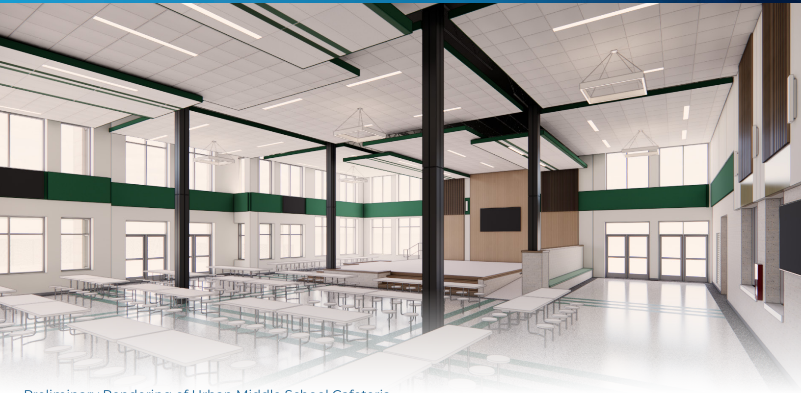
Preliminary Rendering of Urban Middle School Cafeteria