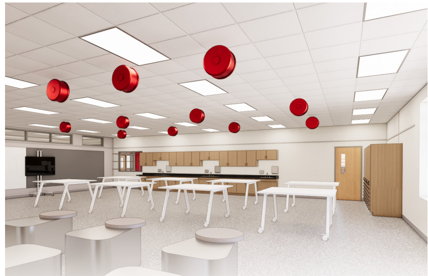
Preliminary Rendering of Farnsworth Middle School Art Room