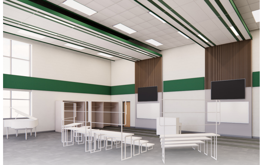
Preliminary Rendering of Urban Middle School Choir Room

These complexities require careful attention as the design is finalized. Meanwhile, the largely new construction at Farnsworth must be carefully fitted onto a relatively limited site, creating unique challenges for building and infrastructure placement.