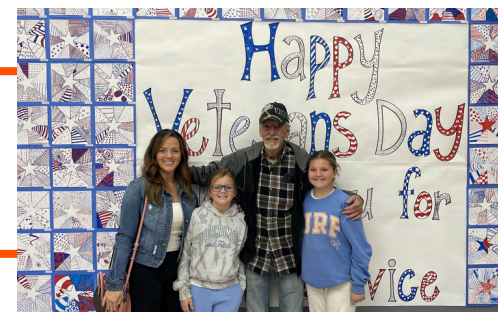
Celebrating Military Service during District-Wide Veterans Day Celebration