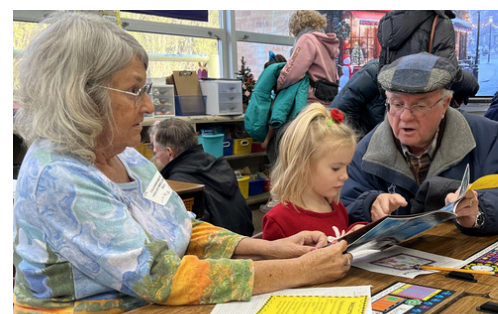
3500+ Guests Welcomed Into Our Schools During "Grandparents and Great Influences" Events

80+ VOLUNTEERS JOINED OUR COMMUNITY ADVISORY TEAM IN 2024-25, TO MEET, LEARN, AND PROVIDE FEEDBACK ON DISTRICT OPERATIONS