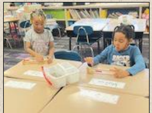
Kindergarten math and art projects