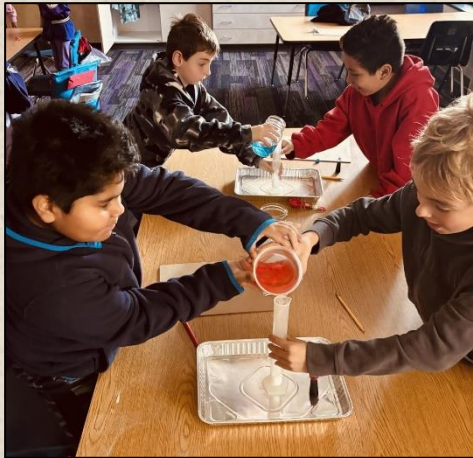
2 nd grade science experiment

Snapshots of creativity, fun, and learning around our school!