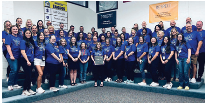
Staff welcomed new families to their classrooms and gathered with fellow colleagues for their all-school staff photos. The start of the school year was spent making connections with families, the community, and with each other.