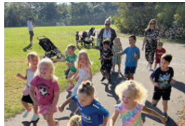
Students and staff at Rice Lake Elementary celebrated their fundraising work with a school-wide bubble run.

CELEBRATING WITH A BUBBLE RUN Rice Lake students and staff celebrated the end of the school's fall fundraiser with a bubble run. Each class made signs and ran around the soccer fields to music and through bubbles. A special thank you to the community for supporting our schools!