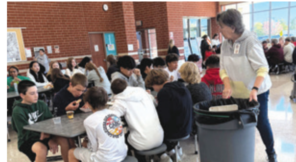
Collaboration among custodial staff, paraprofessionals, food service staff, and students makes lunches at Centennial Middle School smooth and positive.

Centennial Middle School's lunchroom is a busy and bustling place where students and adults work together in a safe, welcoming environment. Students can enjoy a healthy meal provided by our nutrition services, as well as meals brought from home according to family choice. It's remarkable to consider that our middle school serves more meals in a single day than the total population of many small towns in Minnesota.