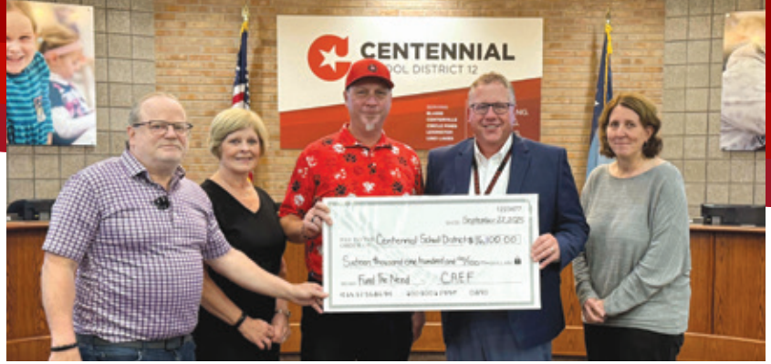
At the 2025 CAEF GALA, $16,100 was raised for Fund The Need for Arts programs preschool through grade 12 in the Centennial School District. The check was presented to the school board at its September meeting.

The Centennial Area Education Foundation is looking for new members. CAEF is a dedicated group of individuals. We are your neighbors, parents, educators, and school board members looking to make an impact in the Centennial School District and our community. As a non-profit education foundation, CAEF awards grants to the staff and community groups in the Centennial School District, provides student scholarships for graduating seniors and hosts an annual Gala to support our grant and scholarship program. If you are interested in becoming part of a CAEF committee or the CAEF Board, please contact us at thecaef@gmail.com . We would love to have you join us!