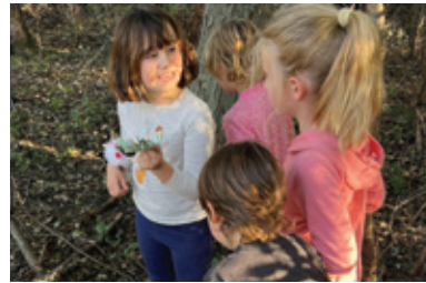
Through hands-on exploration, nature walks, games, and observation, Golden Lake Elementary students are learning about the amazing things our plant and animal neighbors do as the seasons change.