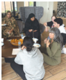
Centennial High School is connecting with the community through its CHS on the Road informational sessions. The fall session focused on health, wellness, and attendance.

CHS ON THE ROAD Centennial High School is hosting a three-part series of community events, sponsored by the Centennial Area Educational Foundation, during the 2025-26 school year. Sessions are held at Landings of Lexington, Centennial Square, and Centerville Elementary and include information sharing, technology instruction, and conversation.