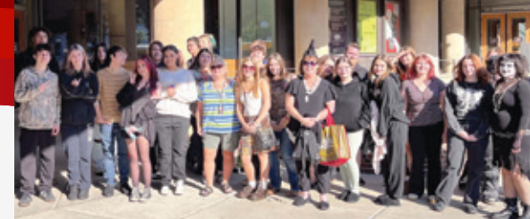
Centennial Area Learning Center students visited the Ordway Center for the Performing Arts for the production of The Addams Family . The field trip was an opportunity for a real-world experience while enhancing classroom learning and also promotes social development by engaging with the broader community.

U.S. News & World Report recognizes Centennial High School as one of the "Best High Schools." The school is ranked #31 in the metro, #35 in the state, and is in the top 40% in the nation. Rankings include public, private, and charter schools and are based on graduation rate, test performance, and college preparation.