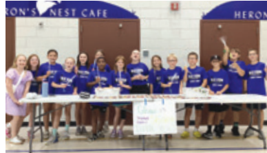
The Blue Heron Elementary Student Council members helped run concessions at their Fall Dance and showed what true school spirit looks like all night long!