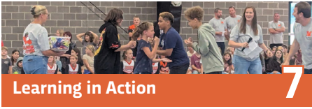
Learning in Action