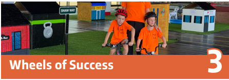
Wheels of Success