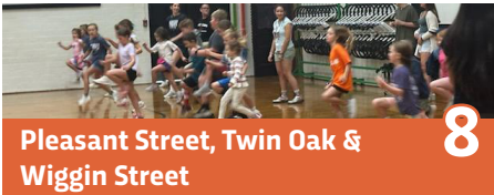
Pleasant Street, Twin Oak & Wiggin Street