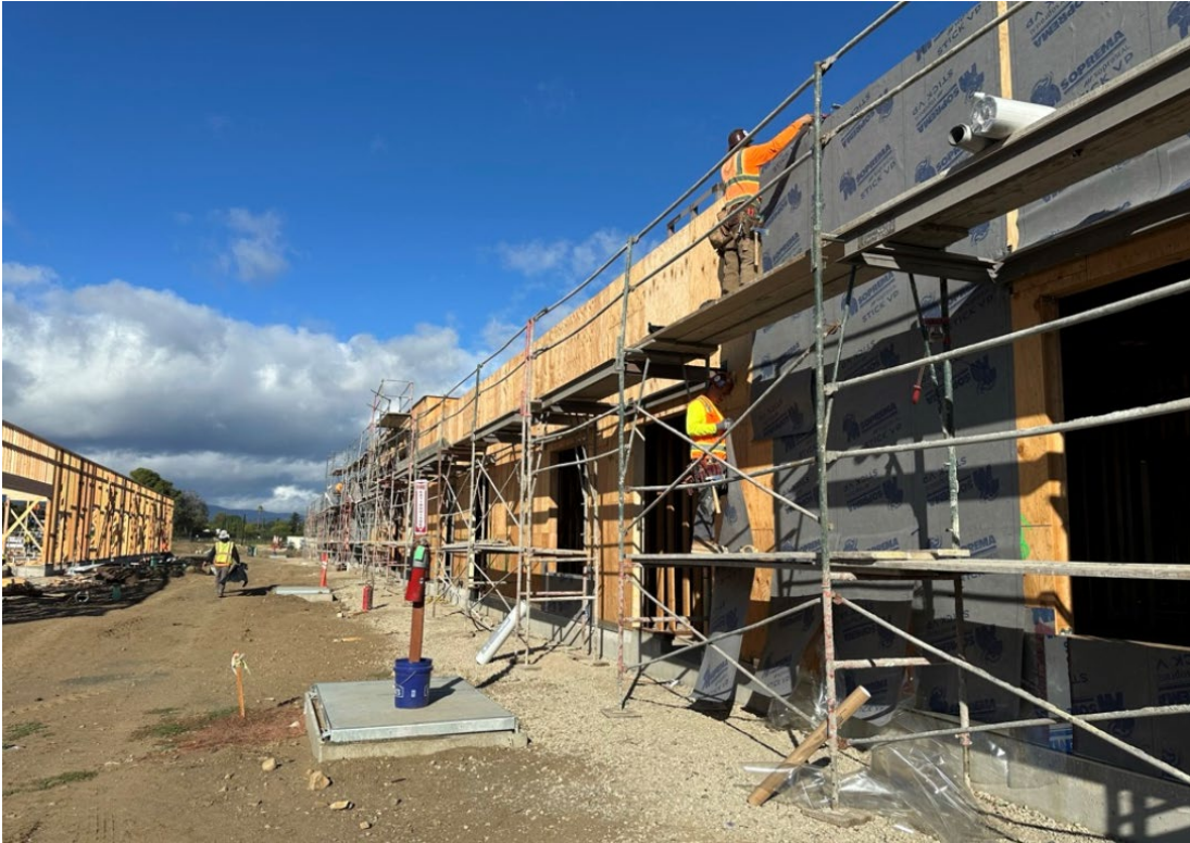
Making buildings weather tight.