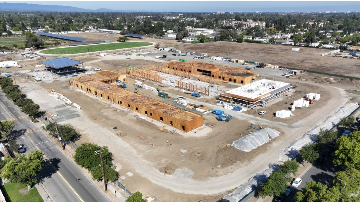
View above Teal Drive on September 17, 2025. The office is on the right, classroom wings in the middle, and the multipurpose building on the left.