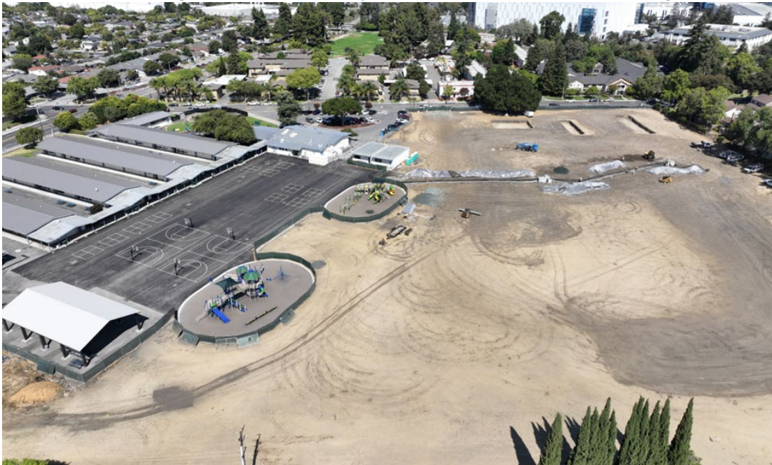
Aerial view looking northwest on September 17, 2025. Roofs are complete. The playground is repaved. The new buildings will be built in the upper right corner of the site.