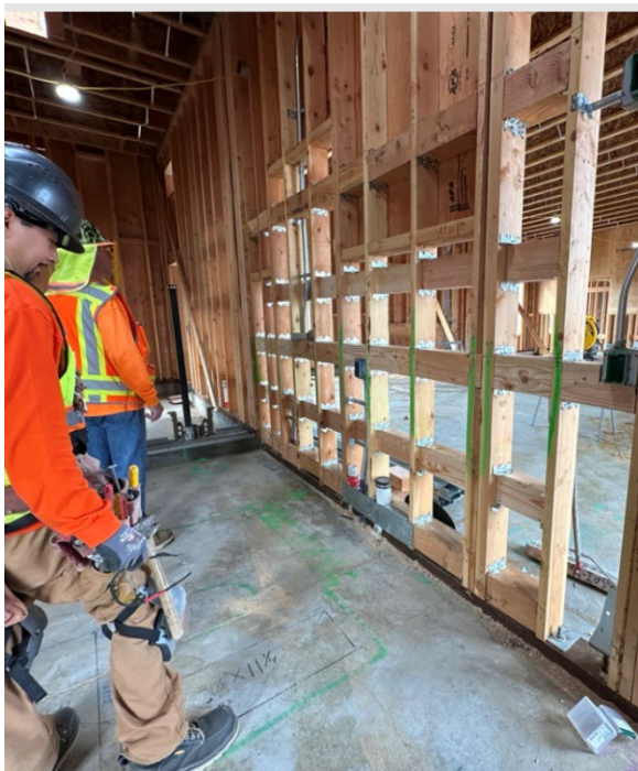
Solid blocking for earthquake safety