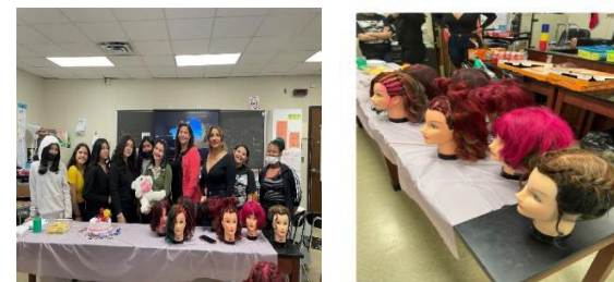
Juli's Beauty Salon - principals in hair design.