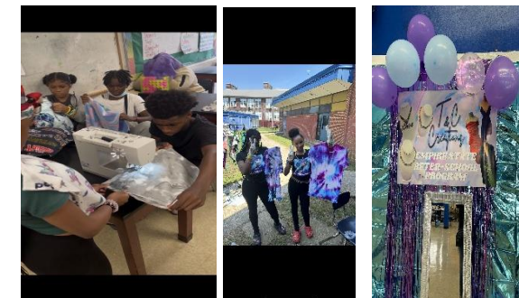
T&C Creations – fashion and design program.