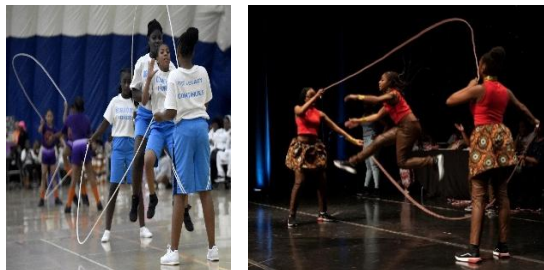
Double Dutch - students will learn the art of Double Dutch, from the fundamentals to advanced routines. (Jackson Main)