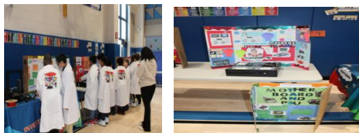
Morrison Mentors (STEAM) -project-based activities that disarm their apprehension about S.T.E.A.M. (Jackson Main & Rhodes Academy)