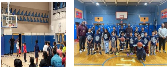
Hoops Youth Basketball – students will develop an appreciation for the game of basketball. (Jackson Main)