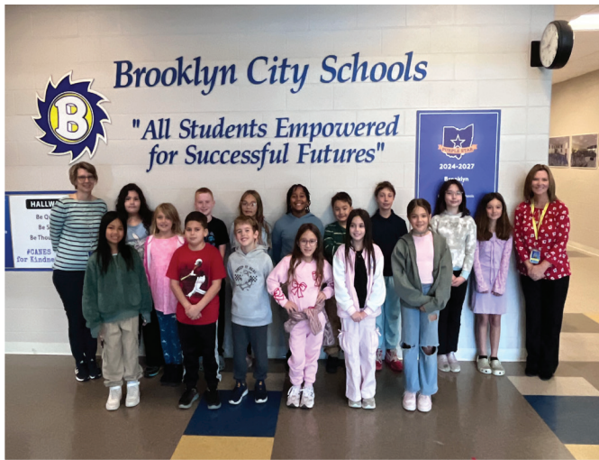
Through the Brooklyn School Buddies and Student Ambassadors programs, students demonstrate leadership, care, and help build a positive school environment.