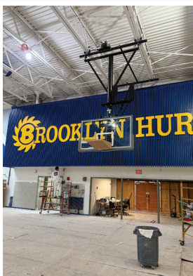
The renovated High School gym will include a new court, main entrance, and more!

Brooklyn's main gymnasium is currently undergoing a transformation, which will result in a new court, scoreboard, bleachers, basketball hoops, and main gym entrance. These upgrades will not only provide our students with an enhanced facility for competitions and classes but also an improved overall experience for families and visitors. Renovations at the main gymnasium will be completed in January 2026. The district looks forward to opening the updated facility to the public for the first time during the first home matchup of the season for the boys' and girls' basketball teams. More information will be shared in the future!