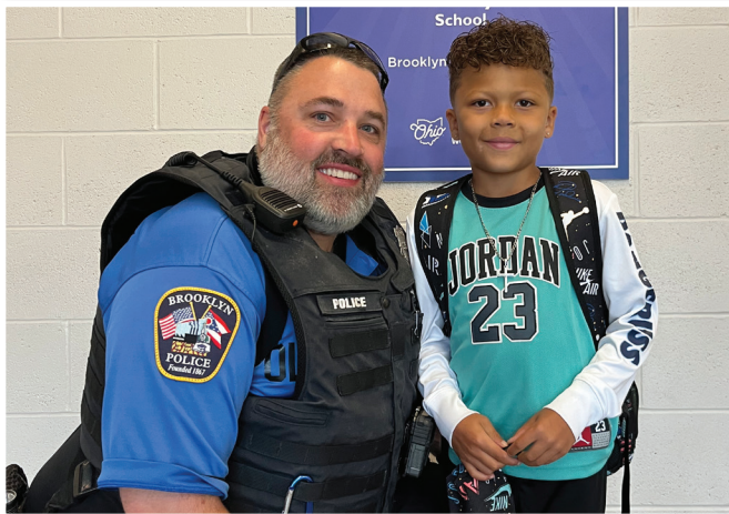
Through the Handle with Care protocol, district staff and Brooklyn safety forces will partner to provide resources to students navigating difficult circumstances.

As part of an effort to enhance available supports for students, the BCSD will be partnering with Brooklyn first-responders to utilize the Handle With Care protocol. Through this new student support system, specific District staff will be notified through a confidential QR code if any Brooklyn student is exposed to a potentially traumatic event resulting in a First Responder incident. The district will then be prepared to provide necessary trauma-informed interventions including: