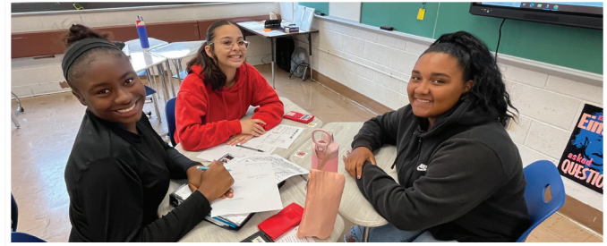
Peer tutoring is one method of instructional support students receive through the Algebra 1 Lab at Brooklyn High School.