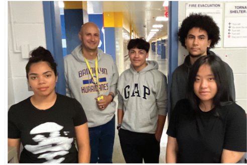
The Community Based Intervention program is designed to meet students where they are, blending academic, career, financial, and life skills into one experience.