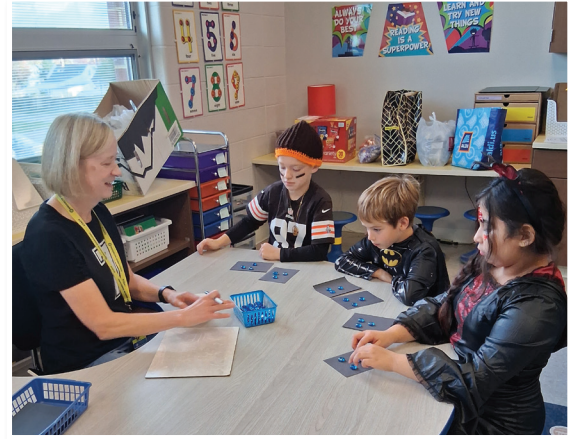
Brooklyn teachers are using the new math assessments to guide instruction and support for each individual student.

The introduction of two new math screening tools for K-3 students in the fall of 2025 will help provide teachers with valuable data to guide individual student instruction and meet their unique learning needs. The Global Strategy Stage (GloSS) Assessment is administered to each student individually and identifies what strategies students use to solve math problems, particularly addition, subtraction, multiplication, and division. The second screener, Individual Knowledge Assessment of Number (IKAN), is administered to the whole class and is used to assess the number facts and patterns each student understands. Both assessments will be administered three times during the school year.