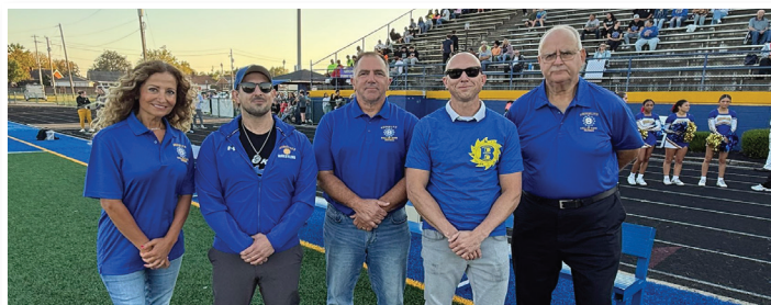
Brooklyn City Schools celebrated members of the Hall of Fame Class of 2025 at the Homecoming Football Game.

The Brooklyn City Schools want to celebrate our alumni! From starting a new job, earning a degree, completing an apprenticeship, or serving in the military, the district wants to recognize our graduates for their achievements. Brooklyn parents, families, and community members can submit a nomination by emailing askdrcalearis@bcshurricanes.org with the graduate's name, graduating year, description of their accomplishment, and current photo if available. The district looks forward to celebrating our alumni on the district's social media accounts during the 2025-2026 school year. Thank you for your support, and Go Hurricanes!