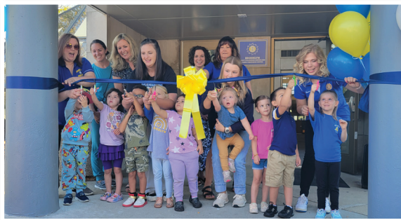
Preschool students, staff, and families celebrated the grand opening of the BECC on October 4th.

A new and exciting chapter for the Brooklyn City Schools has begun with the completion and ongoing progress of several major facility renovation projects across the district. The new Brooklyn Early Childhood Center and Family Resource Center, located at the former site of the Brooklyn Public Library, provides a dedicated space for educating the district's youngest students. Opened to students on September 29th and celebrated with a grand opening to the public on October 4th, the renovated facility includes expanded classrooms, a sensory room, an outdoor playground, and other educational amenities. The new district resource also holds a new conference room that hosts Board of Education meetings, and a Family Resource Center, which will serve the greater Brooklyn community through various programs and initiatives.