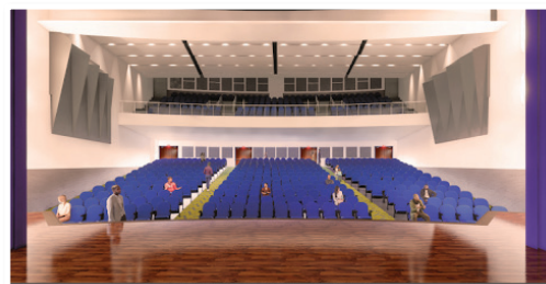
Planned renovations of the Brooklyn Auditorium include new seating, lighting and sound systems, and stage.

The Brooklyn Auditorium is not only a cherished space for assemblies, performances, and other school activities, but a