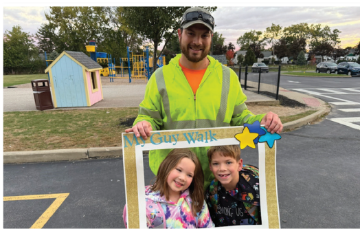
BCSD fathers and father figures walked to school and enjoyed refreshments with students during the My Guy Walk.

Brooklyn School students were joined by fathers and father-figures for the annual Brooklyn My Guy Walk on Thursday, October 9, 2025. During the event, fathers and father-figures walked with their students to the school building, where they enjoyed an assortment of snacks and refreshments at the Gold and Blue Lots, with the opportunity for a picture together. Books celebrating the positive impact of fathers and father-figures, including The Father's Walk and All in a Dad's Day , were made available for students to read at home with their family. Altogether, the event was a wonderful celebration of adult mentors actively engaged with students. A special thank-you to the Brooklyn School PTA for providing snacks and refreshments! On behalf of the Brooklyn City Schools, thank you to all fathers and father-figures for their support and care on behalf of our students!