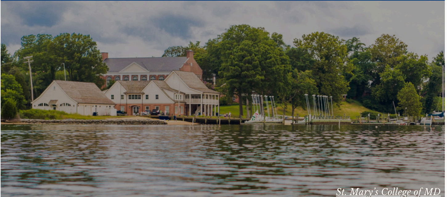
St. Mary's College of MD