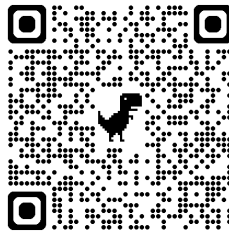
CTE Membership Form