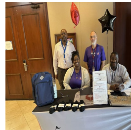
Outreach Community Event