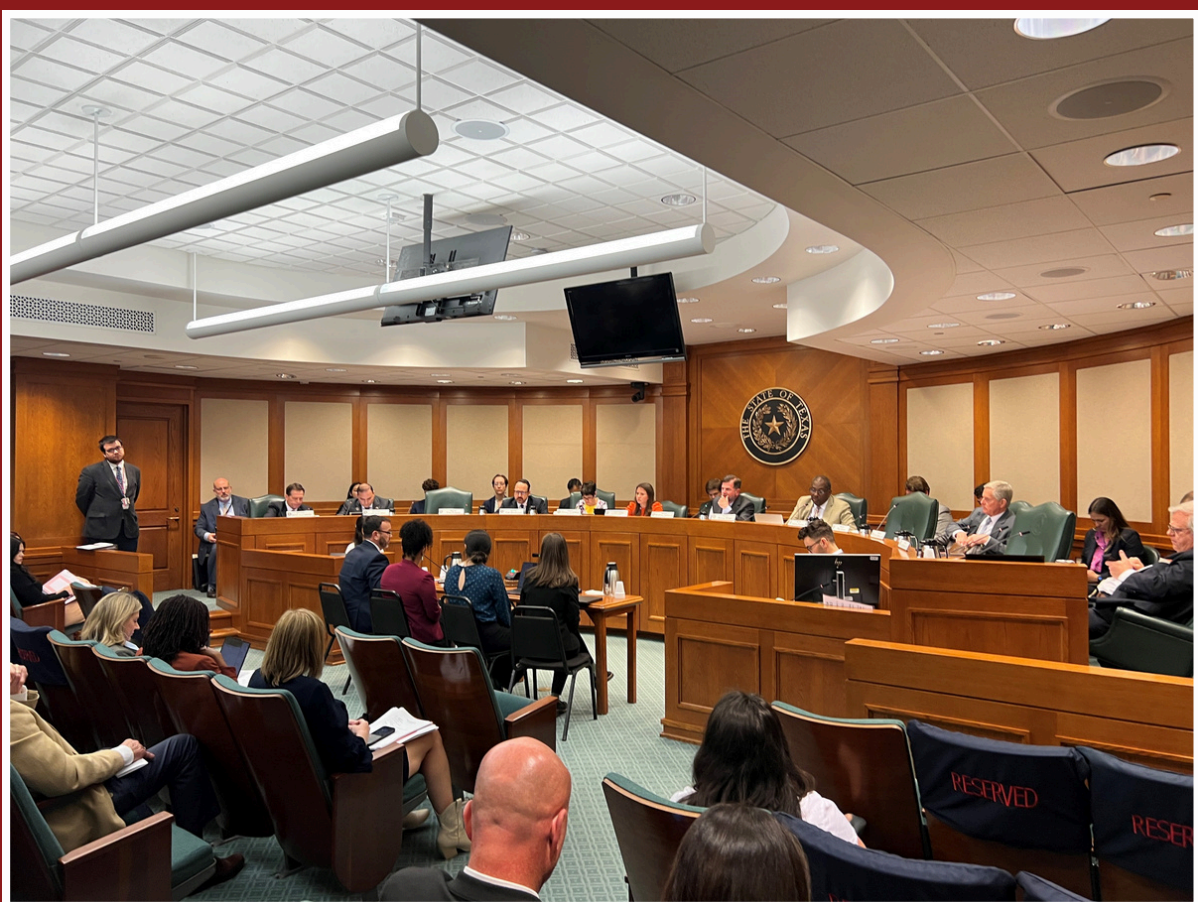
Senate Ed. K-16 Committee hearing - 4/10/25