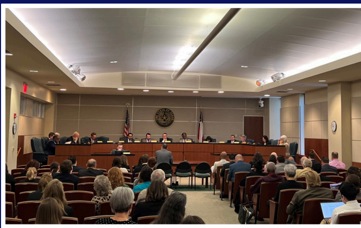
House Public Ed. Committee hearing - 4/10/25