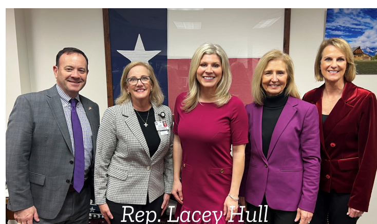
Rep. Lacey Hull