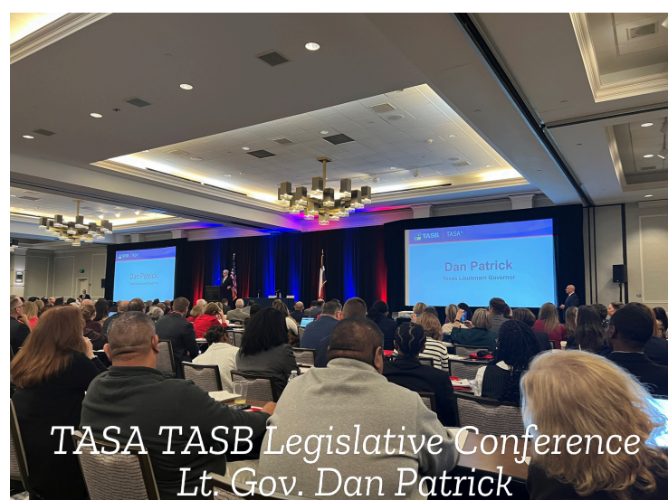
TASA TASB Legislative Conference Lt. Gov. Dan Patrick