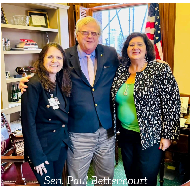
Sen. Paul Bettencourt