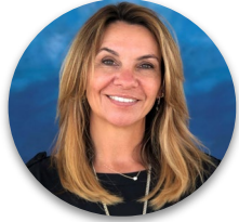
Elke Day Preschool Coordinator, Special Education