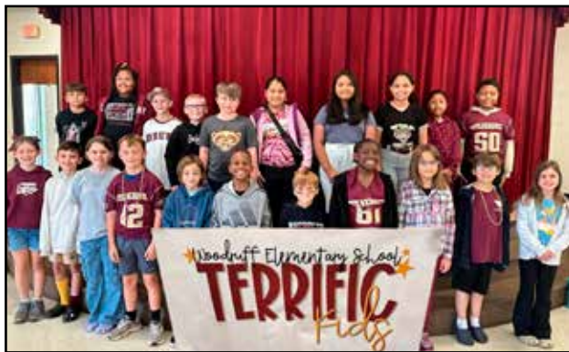
Fourth Grade Terrific Kids