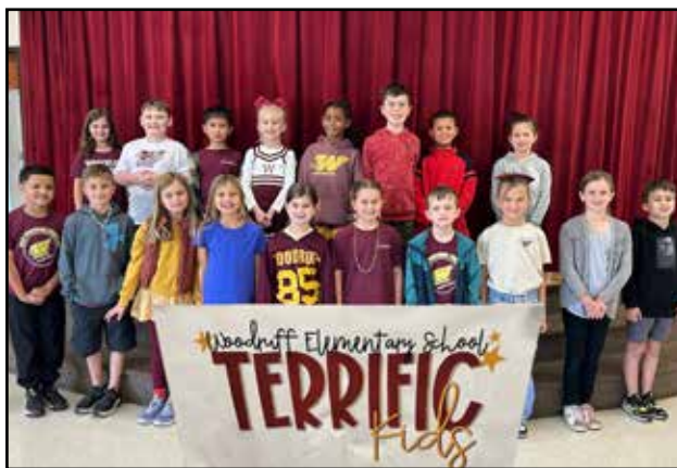
Third Grade Terrific Kids