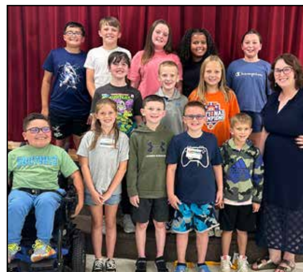
STUDENT COUNCIL 2025 - 2026