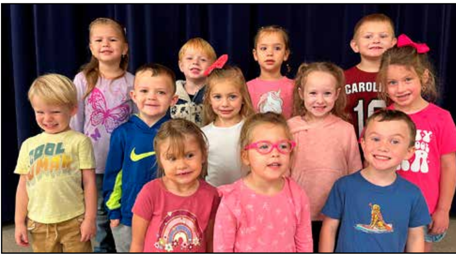
Students pictured left to right