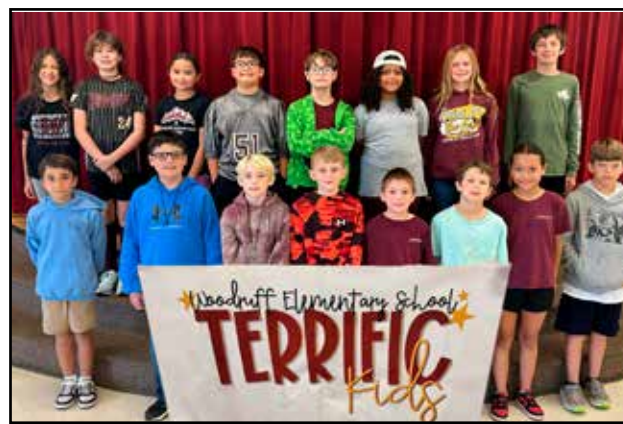
Fifth Grade Terrific Kids