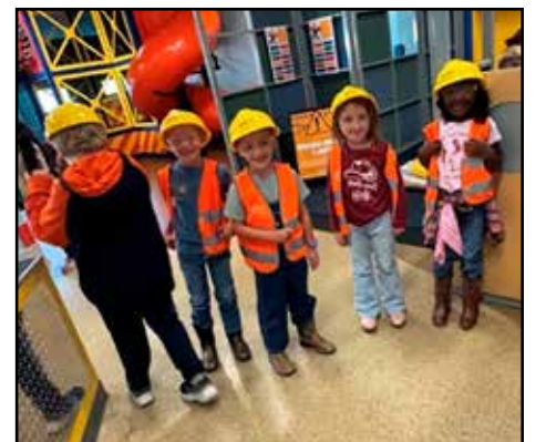
KINDERGARTEN STUDENTS VISIT THE CHILDREN'S MUSEUM OF THE UPSTATE Kindergarten students enjoyed a field trip to The Children's Museum of the Upstate. Students had the opportunity to learn about science, technology, engineering, art and math through engaging activities.