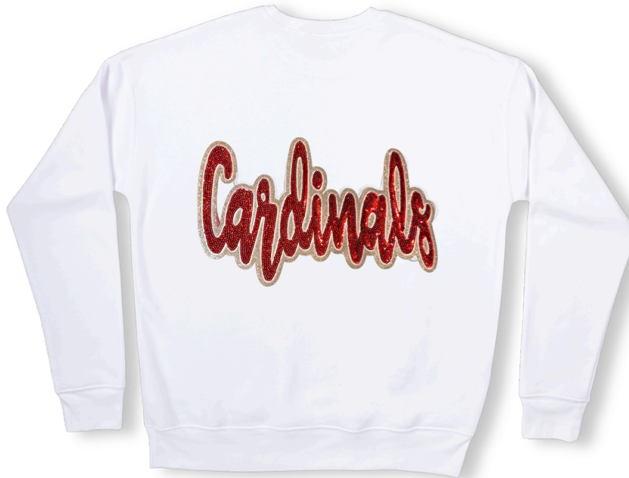
White sweatshirt with red sequin patch

ADULT 'CARDINALS' SWEATSHIRT NOW AVAILABLE!