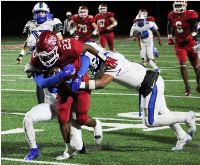
Above:... and then turns it upfield for a 23-yard gain.