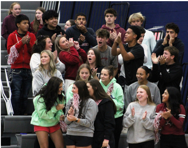
Above: Crockett enjoyed some enthusiastic support from this group of students who made the trek to Rockvale, engaging in some good-natured back-and-forth with the Lady Patriot student fans.