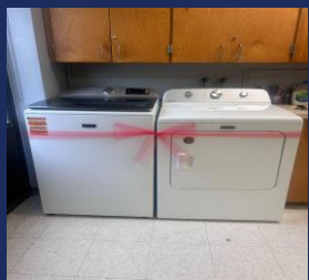
Degy Entertainment Palm Beach Lakes HS