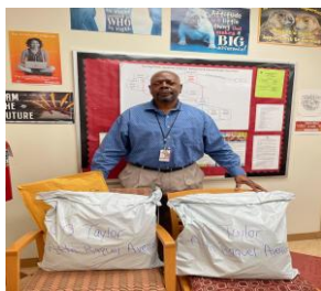
Delivery of Essential Supplies