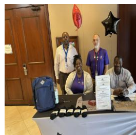
Outreach Community Event