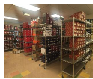
MVP Sneaker Closet