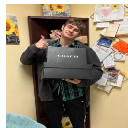
UHY Student Shoe Donation