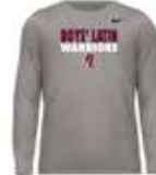
Nike Men's Team Legend Long Sleeve Tee +3 more colors $39.59