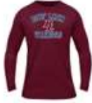
BSN SPORTS Men's Phenom Long Sleeve T- Shirt +3 more colors $27.49