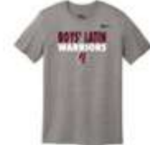
Nike Men's Team Legend Short Sleeve Tee +3 more colors $36.29