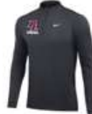
Nike Men's Dri-FIT Element 1/2 Zip Top +1 more color $71.49