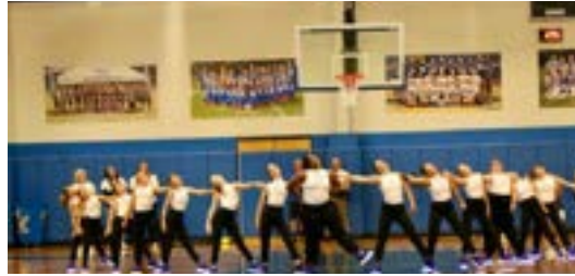
2025 WHMS Dance Team

This classic animated movie centers around Linus and his unwavering faith in the Great Pumpkin, a mythical creature he believes will rise out of the pumpkin patch at midnight and bring toys to children. While the other characters celebrate Halloween with trick-or-treating and parties, Linus waits in the pumpkin patch. Eventually, he experiences a moment of excitement when Snoopy's flight as a World War I flying ace is mistaken for the Great Pumpkin. Will Linus prove to the others that the Great Pumpkin is real?