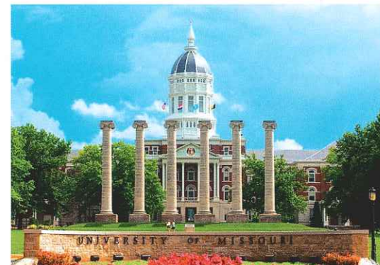
University of Missouri-Columbia

Free Workshops, Free Brokerage Accounts, and Free Study Abroad provide recipients with a practical understanding of important life skills not typically covered in the school curriculum.