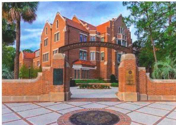
University of Florida