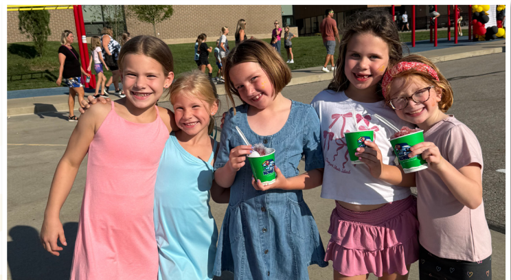
Thanks to our BBHES PSO for making back-to-school enjoyable for our students!