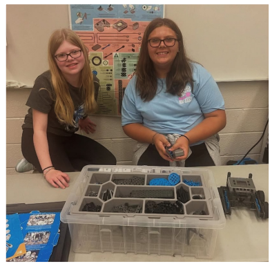
Middle School STEM students constructing vehicles, using innovation, creativity, and logic for these exercises.