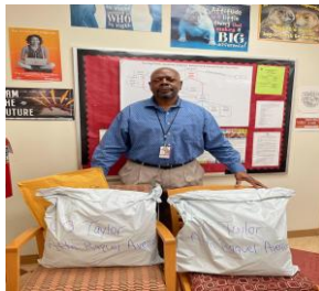
Delivery of Essential Supplies