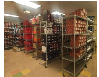
MVP Sneaker Closet