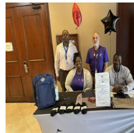
Outreach Community Event