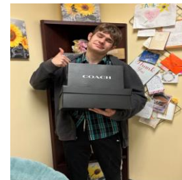
UHY Student Shoe Donation