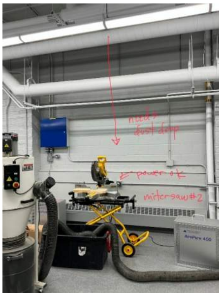
Equipment in new location needs dust drop.