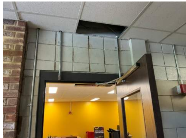
Door from vestibule to office installed and electrical conduit prep