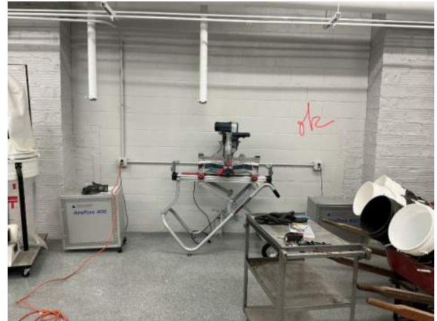
Some equipment in position and noted as such.