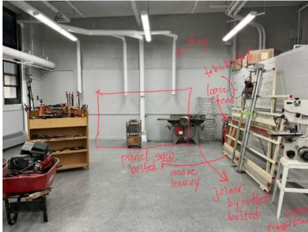
Example photo of equipment moves.