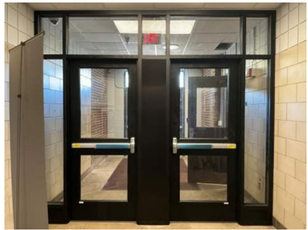
Door 13 aluminum storefront and doors installed