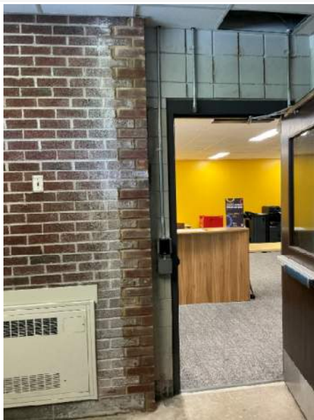
Door 13 low voltage prepped and brick repaired