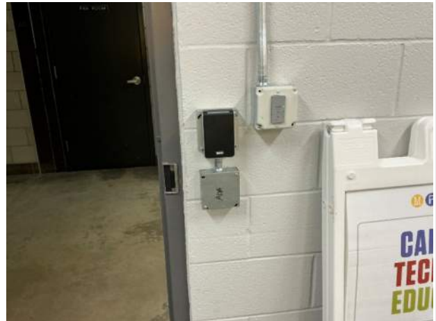
Office side card reader and ADA prep