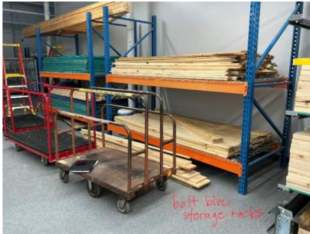
Construction Lab needs item bolted down.