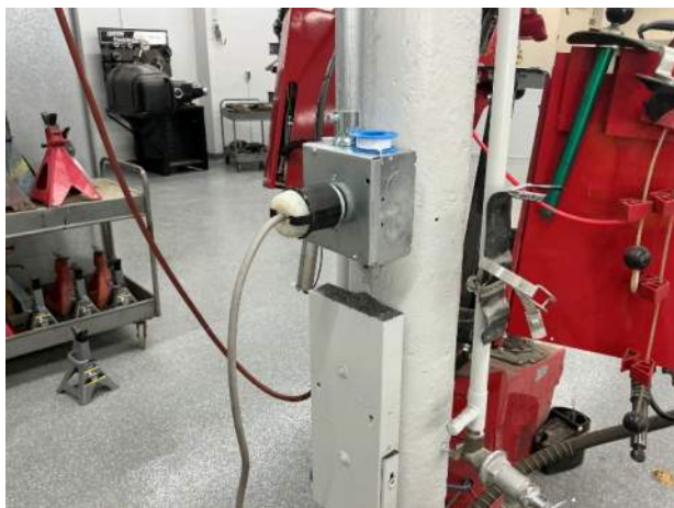
PR outlets installed and in use