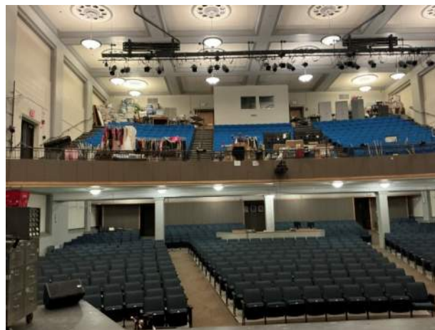
Theater upper level status – being moved to scene shop