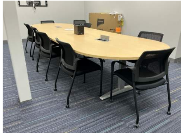
Large conference room table with LV box to be installed and monitor bracket on back wall