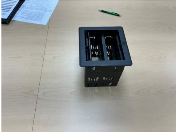
LV box for controls of monitor to be placed in conference table, located to avoid table support brackets