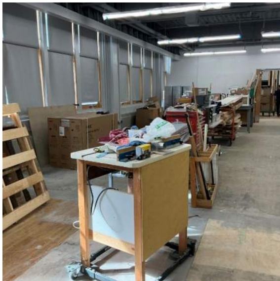
Owner theater items being moved into scene shop