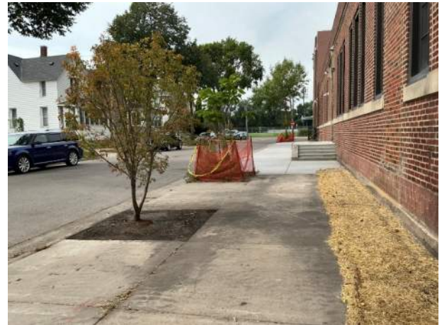
Second tree installed and restoration against building