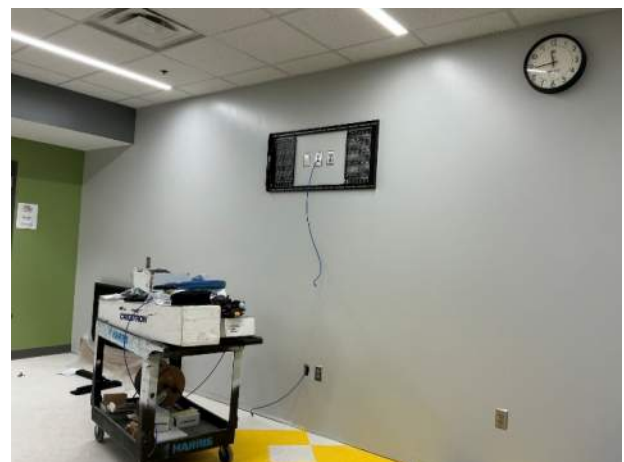
Lab 124 commons LV monitor bracket in process and clock installed