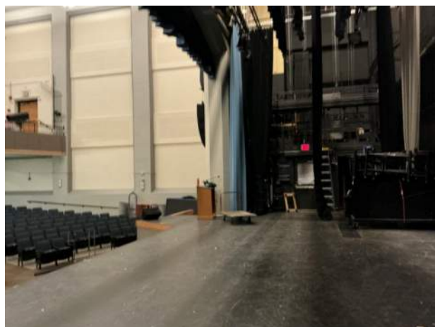
Theater stage empty now