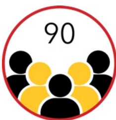
Students Senior Class