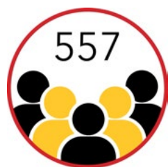
Students 7 th to 12 th grades