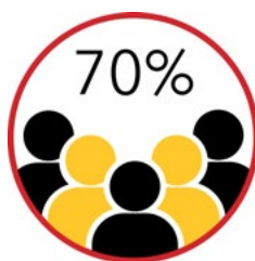
Faculty members holding a master's or a doctoral degree