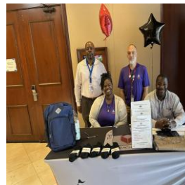
Outreach Community Event