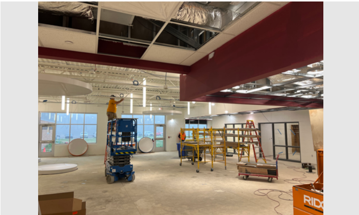
Description: Light fixtures and clouds being installed in the Media Center