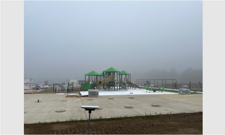
Description: Turf installation started on the north playground