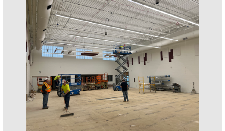
Description: Ceiling baffles being hung in the cafeteria