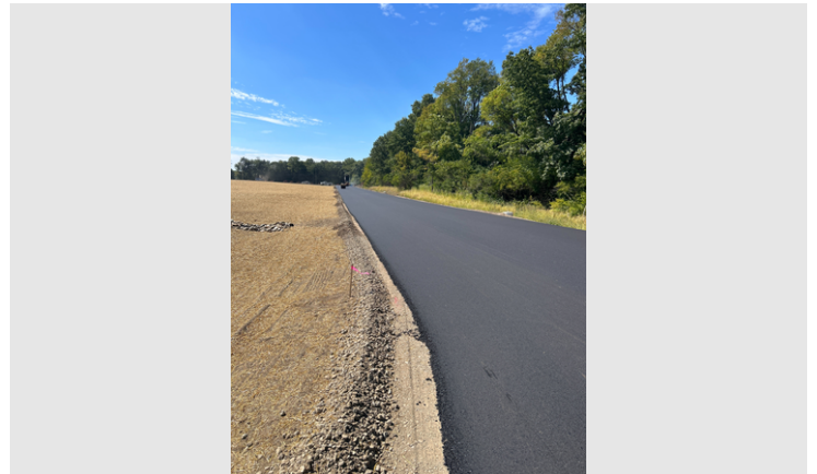
Description: base course of asphalt is complete on the whole site.