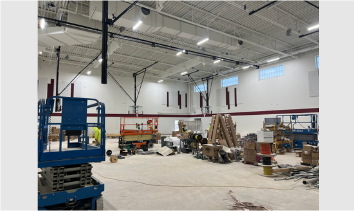
Description: Basketball hoops, acoustical wall panels, divider curtain and finish paint being completed in the main gym.