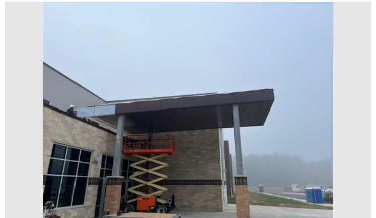
Description: ACM panels completed on the front canopy