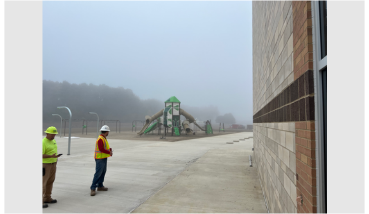
Description: South playground installed. Turf installation starting next week.