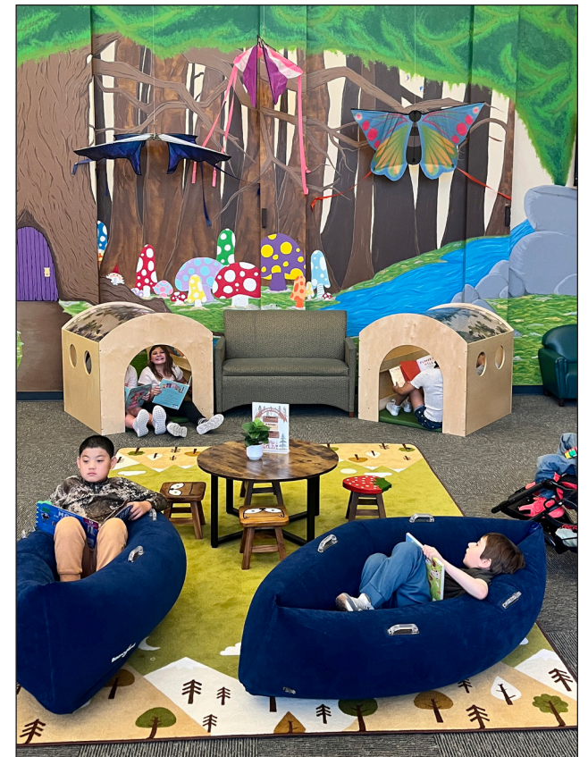
Students in Horace Mann's CHAMPS unit enjoy some of the new sensory furniture purchased for the school's library with a grant from GDP Employees' Foundation.

sory furniture isn't just supporting students with disabilities—it has made the library more engaging, comfortable, and inviting for all.