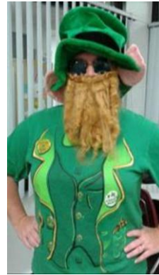
Thing One and Thing Two visited for Dr. Seuss' birthday. Lemi Leprechaun visited the students for St. Patrick's Day