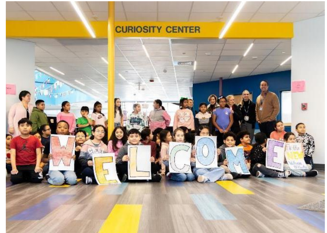
William D'Abate Elementary School