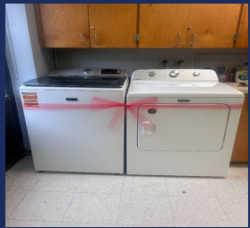
Degy Entertainment Palm Beach Lakes HS