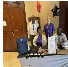
Outreach Community Event